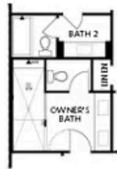
OPT Walk-Through Shower