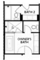
OPT Decked Tub with Separate Shower