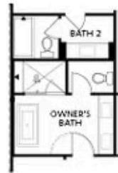
OPT Freestanding Tub with Separate Shower