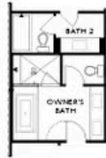
OPT Decked Tub with Seperate Shower