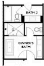
OPT Freestanding Tub with Seperate Shower