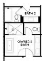
OPT Freestanding Tub with Separate Shower