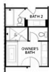
OPT Decked Tub with Separate Shower