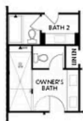
OPT Walk-Through Shower