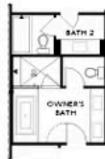
OPT Decked Tub with Seperate Shower