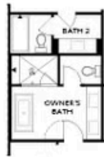
OPT Freestanding Tub with Seperate Shower