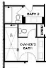
OPT Walk-Through Shower