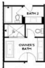
OPT Freestanding Tub with Seperate Shower