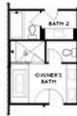
OPT Decked Tub with Seperate Shower