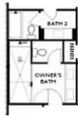
OPT Walk-Through Shower