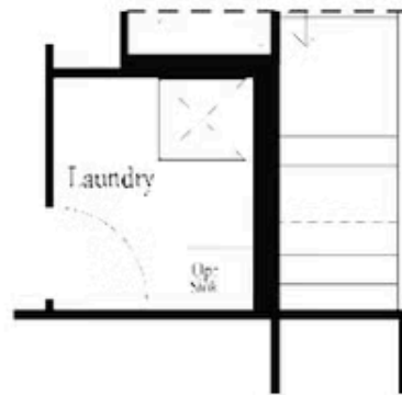
Opt. Laundry Room with Sink