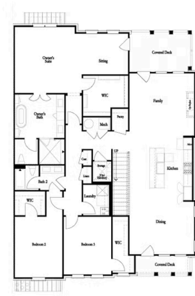
SECOND FLOOR - RIGHT END UNIT