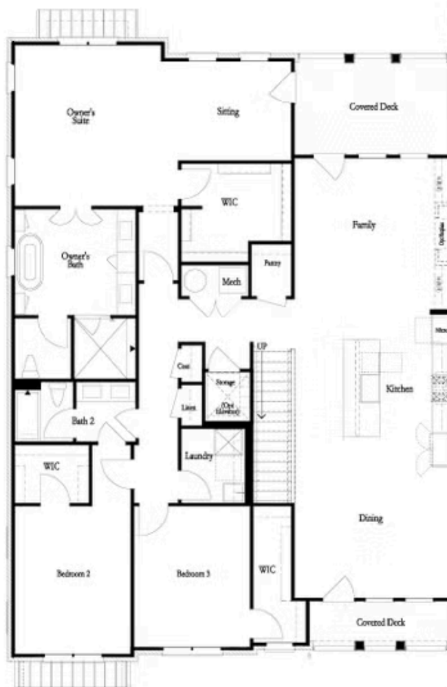
SECOND FLOOR - LEFT END UNIT