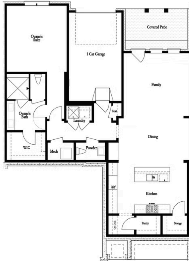
Terrace Level - Middle Unit