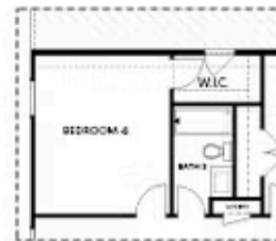
OPT BDR 4 ilo Loft