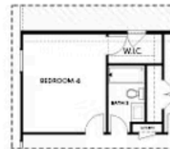
OPT BDR 4 ilo Loft