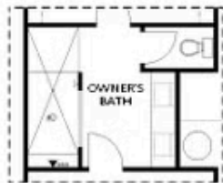
OPT Walk-In Shower