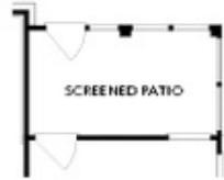
OPT Screened Patio