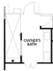
OPT Large Shower