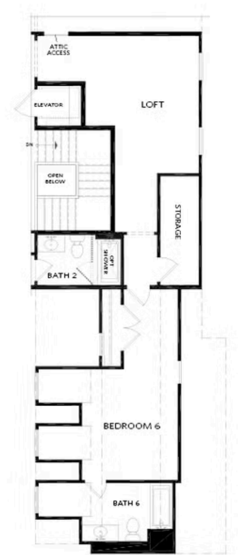
OPT Bedroom 6 w. Full Bath 6 Over Garage