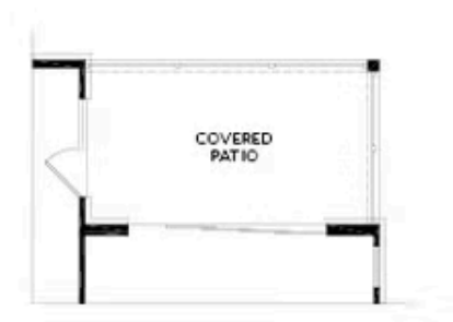
OPT Slider Door at Covered Deck