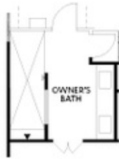
OPT Large Shower