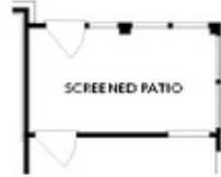
OPT Screened Patio