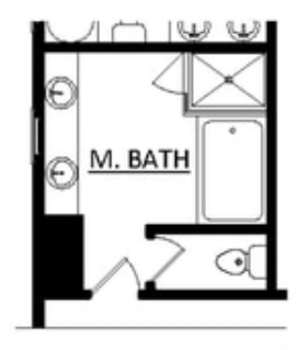
OPT. OWNER'S BATH W/ TUB