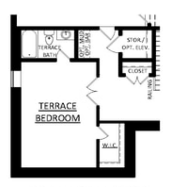
OPT. TERRACE BEDROOM