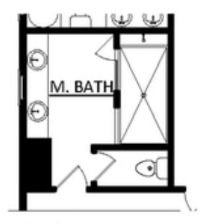
OPT. OWNER'S BATH W/ WALK-IN SHOWER