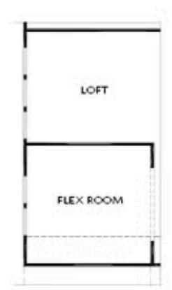
OPT Flex Room