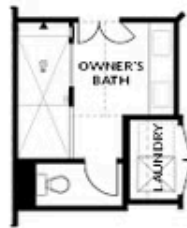
OPT Walk-Through Shower