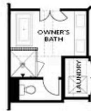
OPT Freestanding Tub/Shower Combo