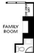
OPT Linear Fireplace