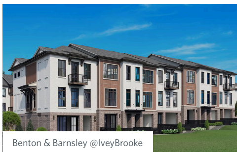
Benton & Barnsley