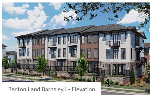
Benton I and Barnsley I - Elevation