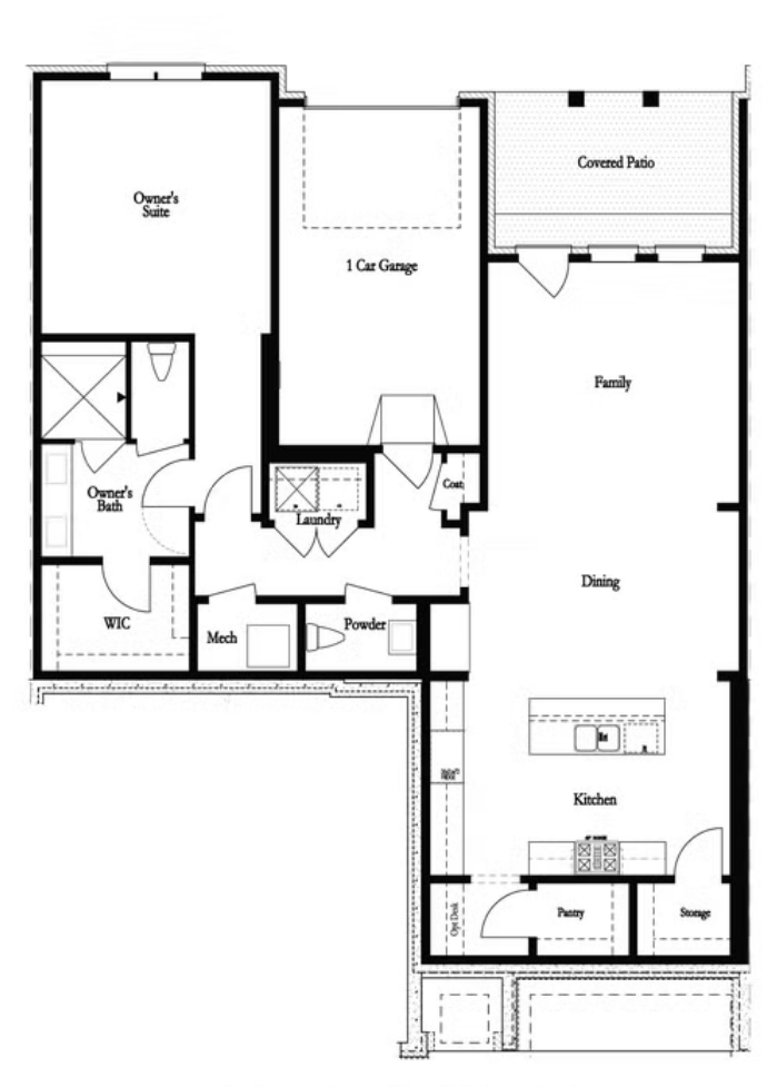
Terrace Level - Middle Unit

4979 SEALY CIRCLE, 83 THE\ ADAMS CONDOMINIUM IN WATERSIDE CONDOS | PEACHTREE CORNERS, GA