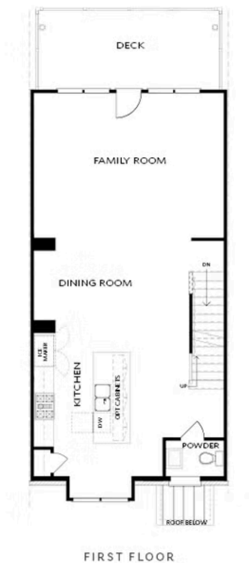
First Floor Elevations B & C Floor Plan Layout