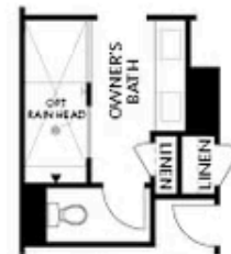
OPT Owner's Walk-Through Shower