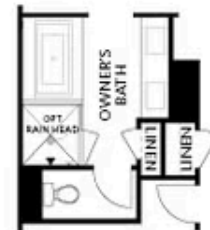
OPT Owner's Shower & Tub Combo