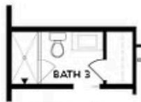
OPT Shower ilo Tub/Shower Combo