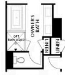
OPT Owner's Shower & Tub Combo