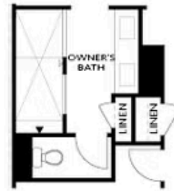
OPT Owner's Walk-Through Shower