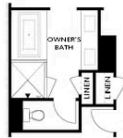
OPT Owner's Shower & Tub Combo