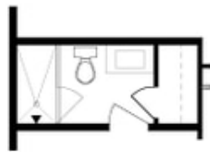
OPT Bath 3 Shower ilo Tub/Shower Combo