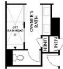
OPT Owner's Walk-Through Shower