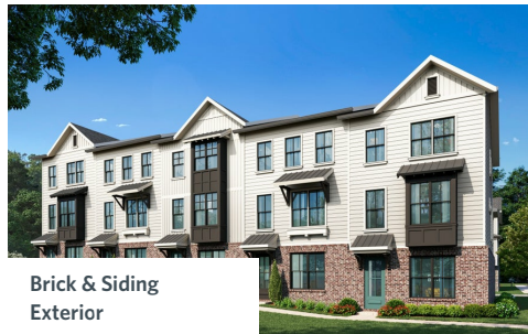
Brick & Siding Exterior