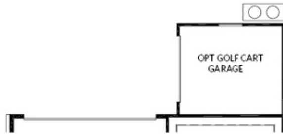
OPT Golf Cart Garage