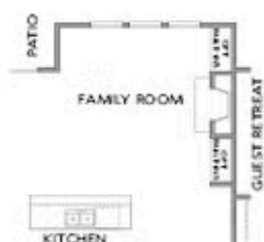
OPT Fireplace with OPT Built-Ins