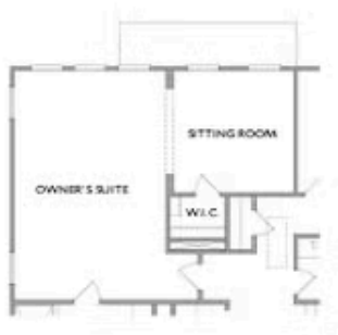
OPT Sitting Room ilo Bedroom 4