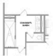
OPT Owner's Walk-In Shower