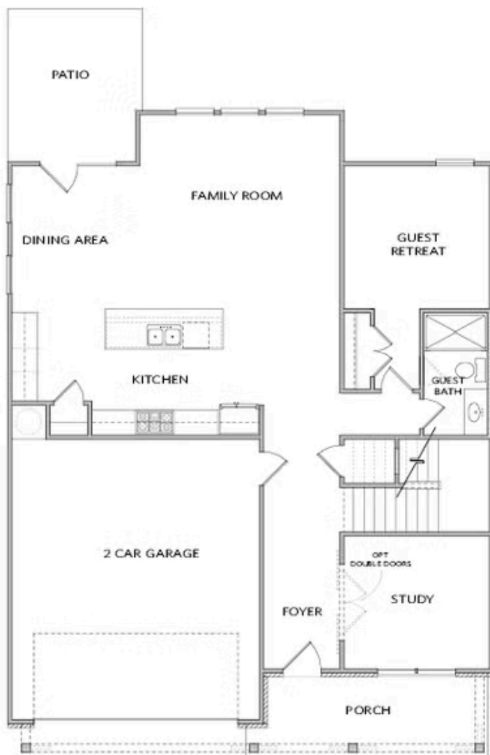
Elevation A, B, C, D