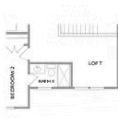
OPT Bath 3