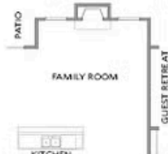
OPT Rear Fireplace