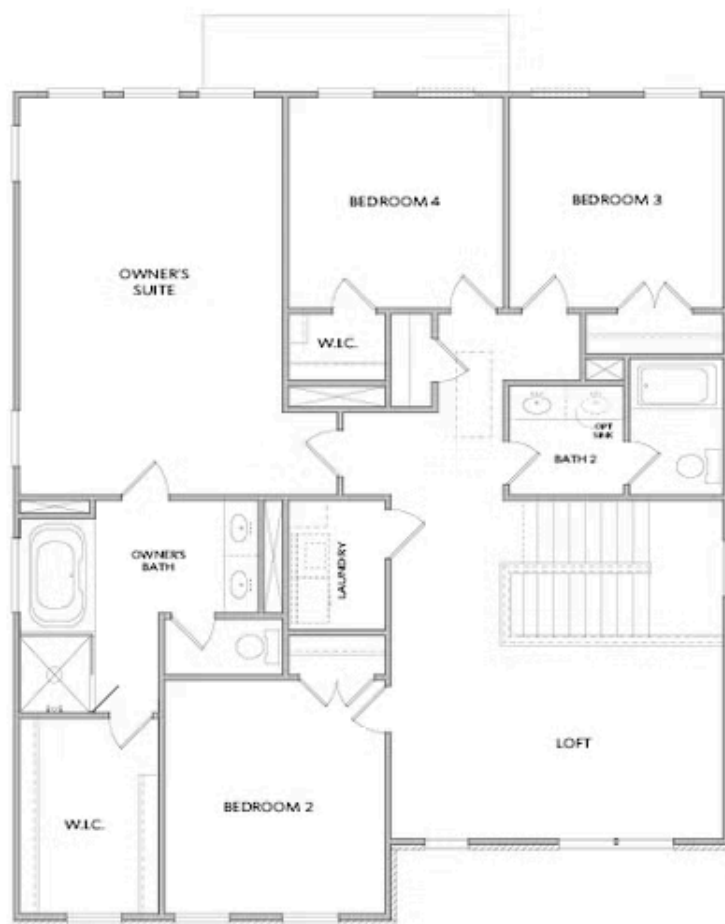
Elevation A, B, C, D