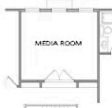
OPT Media Room ilo of Two-Story Family Room