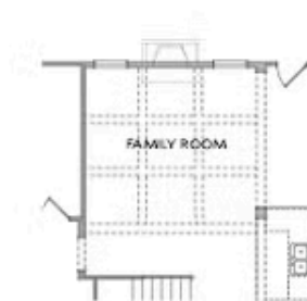
OPT Coffered Ceilings With OPT Media Room -or- Bedroom 5 Above