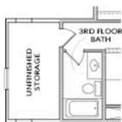
OPT Third Floor Bath