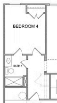
Opt. Bedroom 4 w/ Full Bath No Study & Power Room