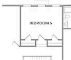
OPT Bedroom 5 ilo of Two-Story Family Room