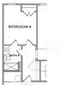
OPT Bedroom 4 w. Full Bath 4 llo Study & Powder Room