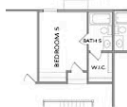
OPT Bedroom 5 w. Bath 5 ilo of Two-Story Family Room