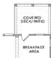
OPT Covered Deck/Patio