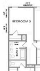
OPT En-Law Suite at Bedroom 3