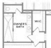
OPT Owner's Walk-In Shower