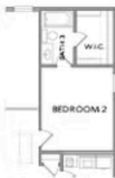
OPT Bath 3 at Bedroom 2