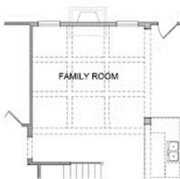
Opt. Coffered Ceilings w/ Opt. Media Room or Bedroom 5 above