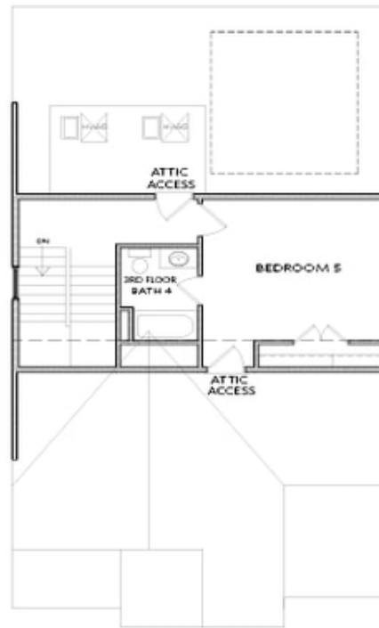
OPT 3rd Floor w/ Bedroom 5 & Bath 4