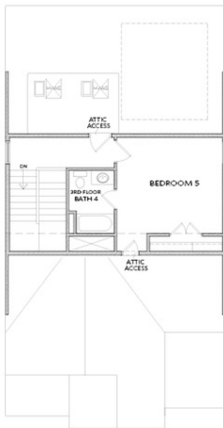
OPT THIRD FLOOR