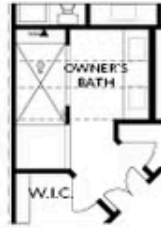
OPT Walk-Through Shower