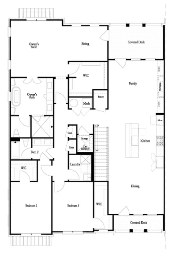
SECOND FLOOR - LEFT END UNIT