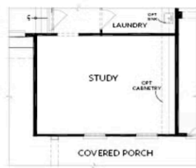
OPT Study ilo 1-Car Garage