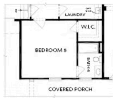
OPT Bedroom 5 ilo 1-Car Garage