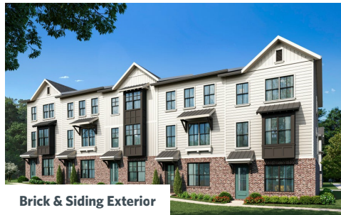
Brick & Siding Exterior