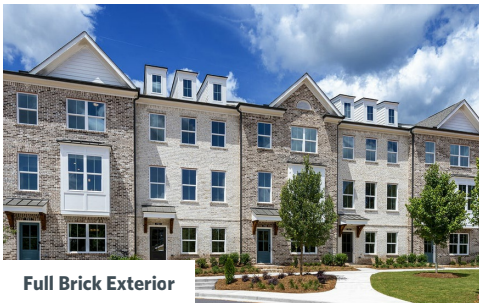
Full Brick Exterior