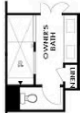
OPT Walk-Through Shower