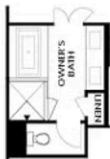
OPT Shower & Decked Tub