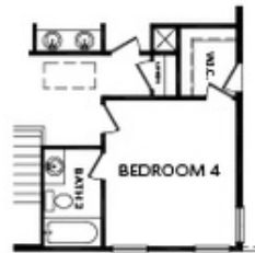
OPT Bedroom 4 w/ Full Bath 3