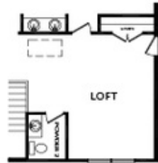
OPT 2nd Powder Room