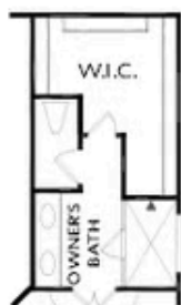
OPT Extended Owner's W.I.C. w/ Large Shower Only