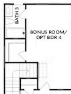
OPT Bedroom 4 w/ Bath 3 ilo Bonus Room