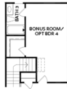
OPT Bedroom 4 w/ Bath 3 ilo Bonus Room