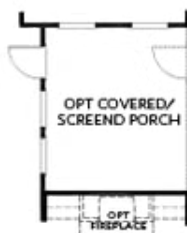
OPT Covered Porch/ OPT Screened Porch