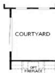
OPT Slider Door