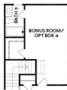
OPT Bedroom 4 w/ Bath 3 i/o Bonus Room