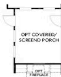
OPT Covered Porch/ OPT Screened Porch