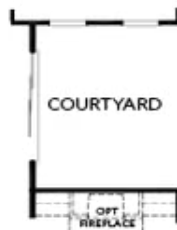
OPT Slider Door