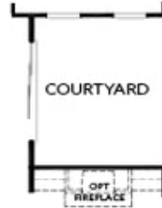
OPT Slider Door