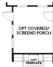
OPT Covered Porch/ OPT Screened Porch