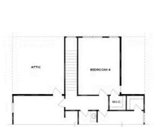
OPT Bedroom 4 flo Loft