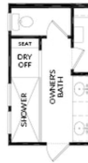
OPT Owner's Walk-Through Sower