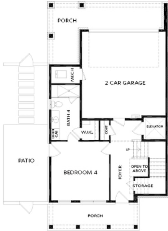
OPT Bedroom 4 into Recreation Room