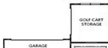
OPT Golf Cart Storage