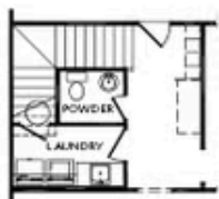
Stair Layout IF OPT Second Floor