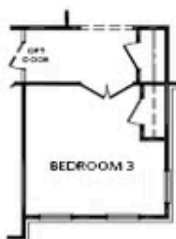
OPT Bedroom 3 ilo Office