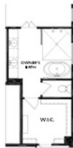
OPT Owner's Wet Bath