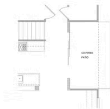
OPTION WHEN 8' SLIDING GLASS DOOR