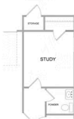
OPTION WHEN EXTERIOR STORAGE and INTERIOR CLOSET