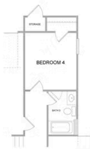
OPTION WHEN BEDROOM 4 and BATH 3