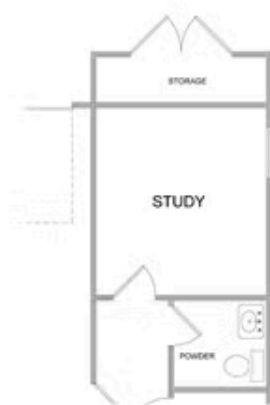
OPTION WHEN EXTERIOR STORAGE SHED