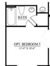
Optional 5th Bedroom ILO Living Room