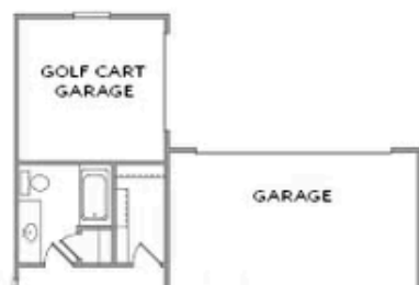
OPT Golf Cart Garage