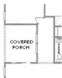
OPT Sliding Glass Door