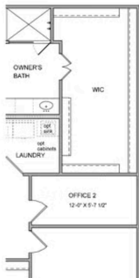
OPT OFFICE 2